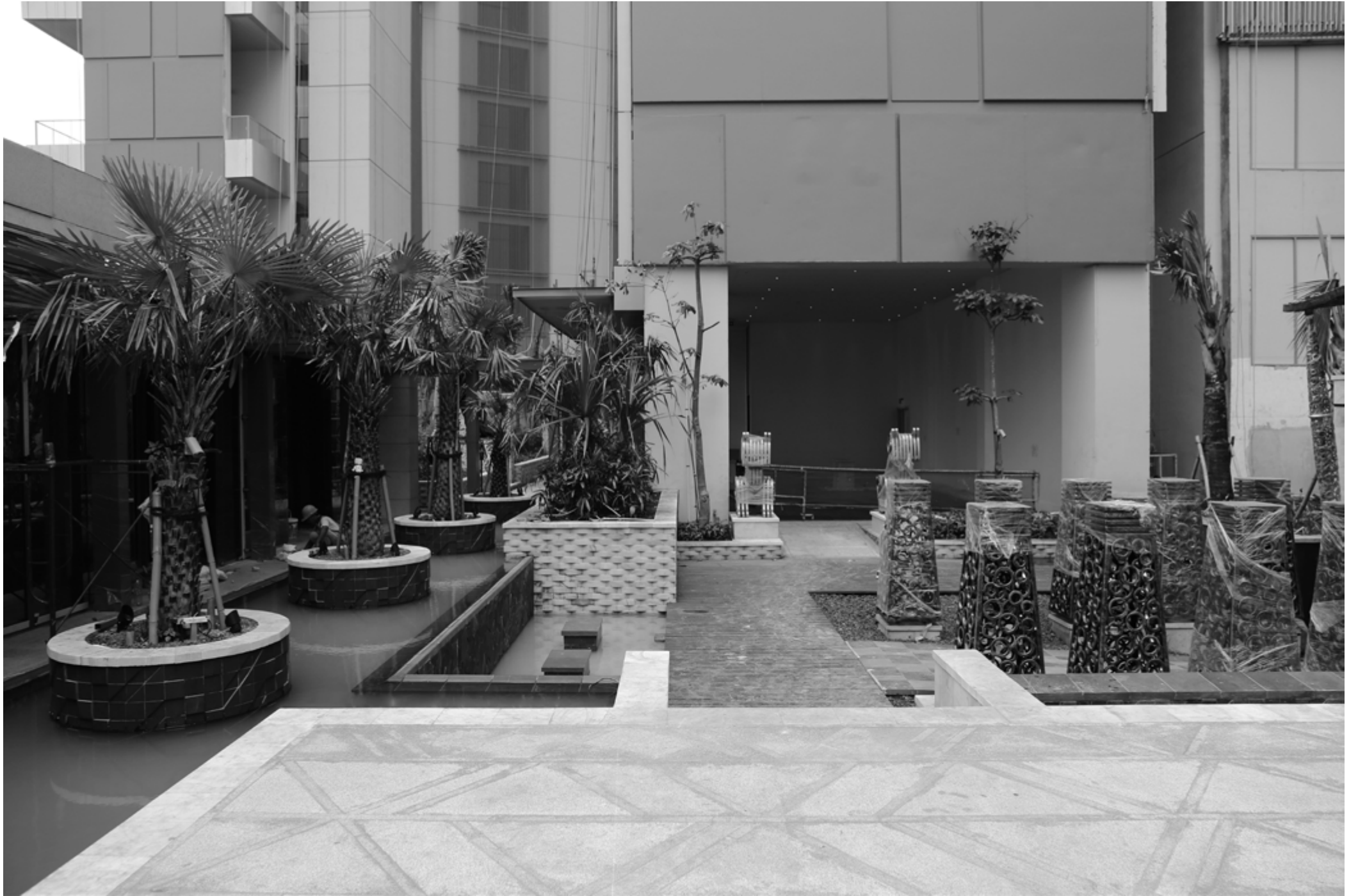
Lawn at Level 3