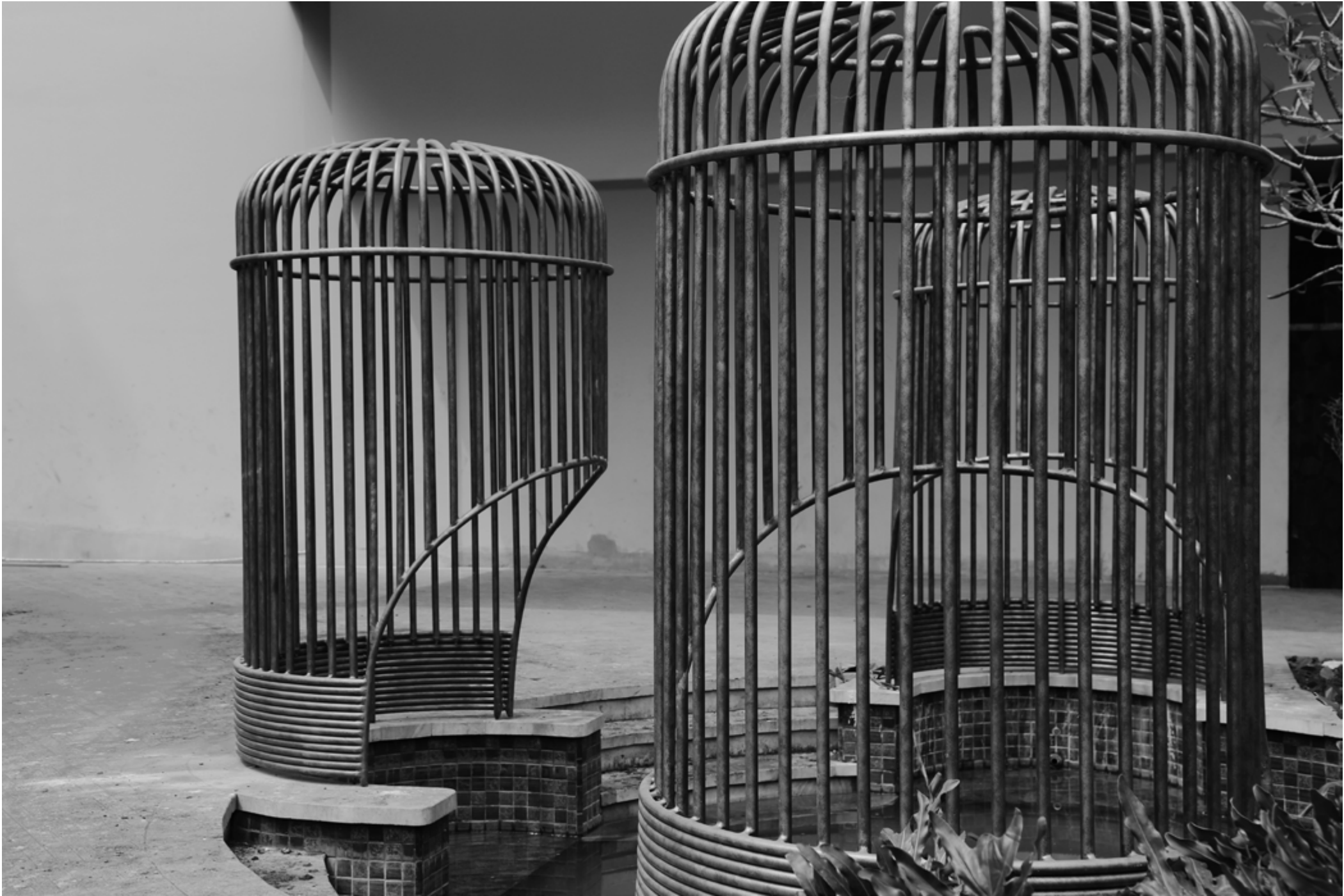
Artwork at Kids' Pool