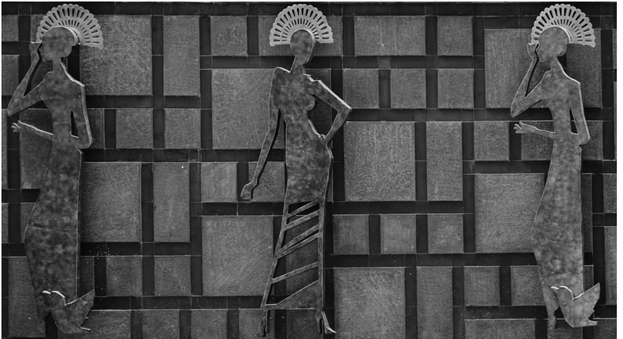
Artwork at Tower 2 & 3