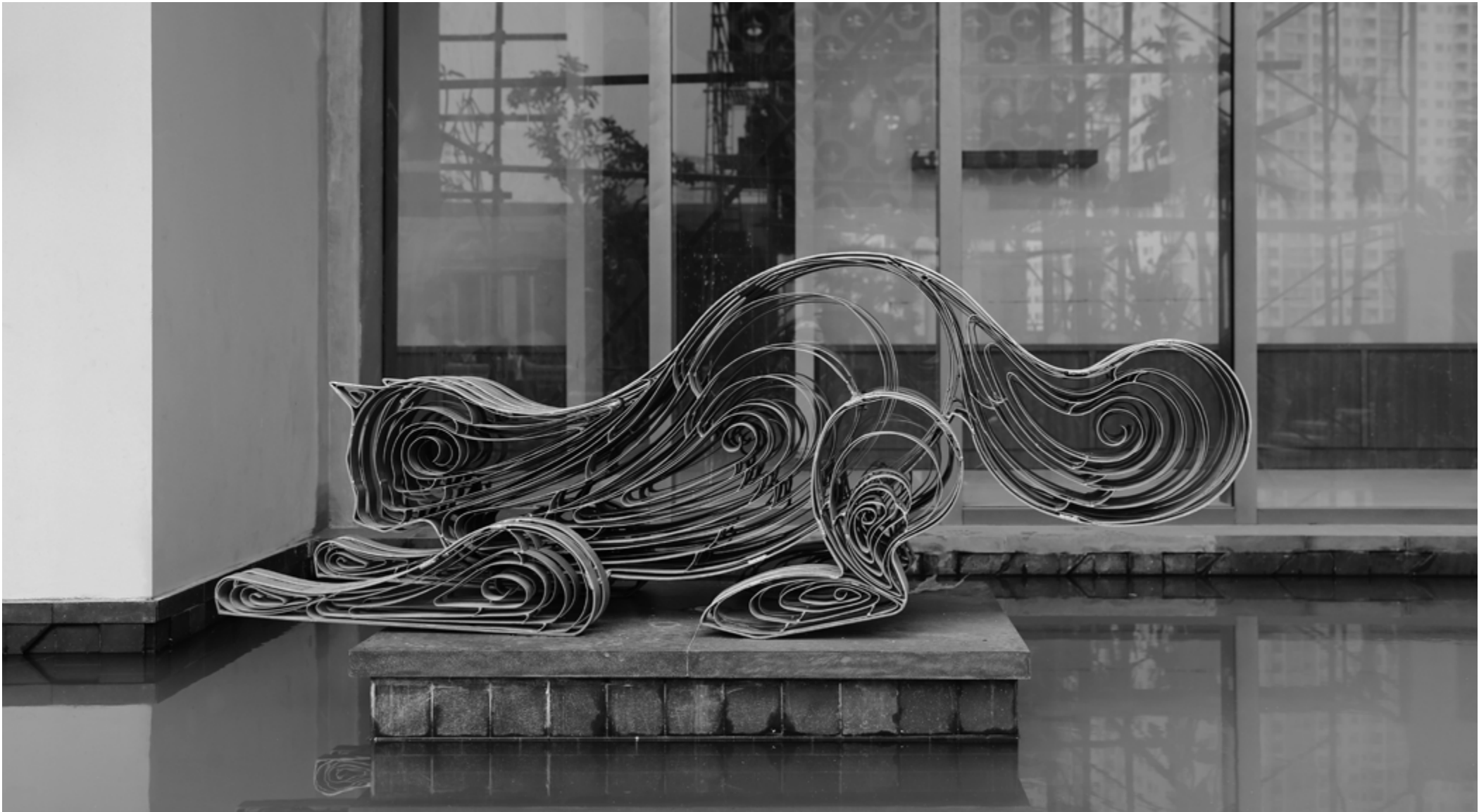
Artwork at Level 3