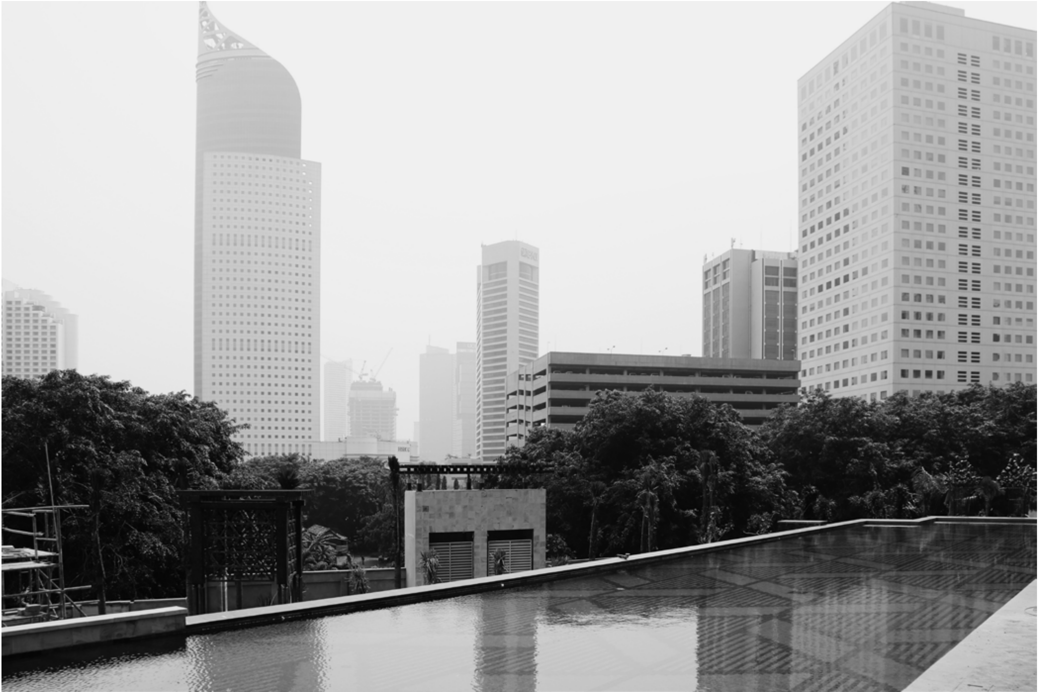
Main Pool view at Level 1