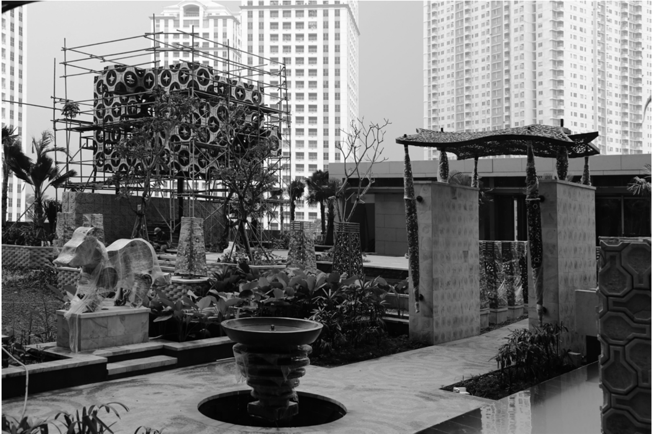
Lawn at Level 3