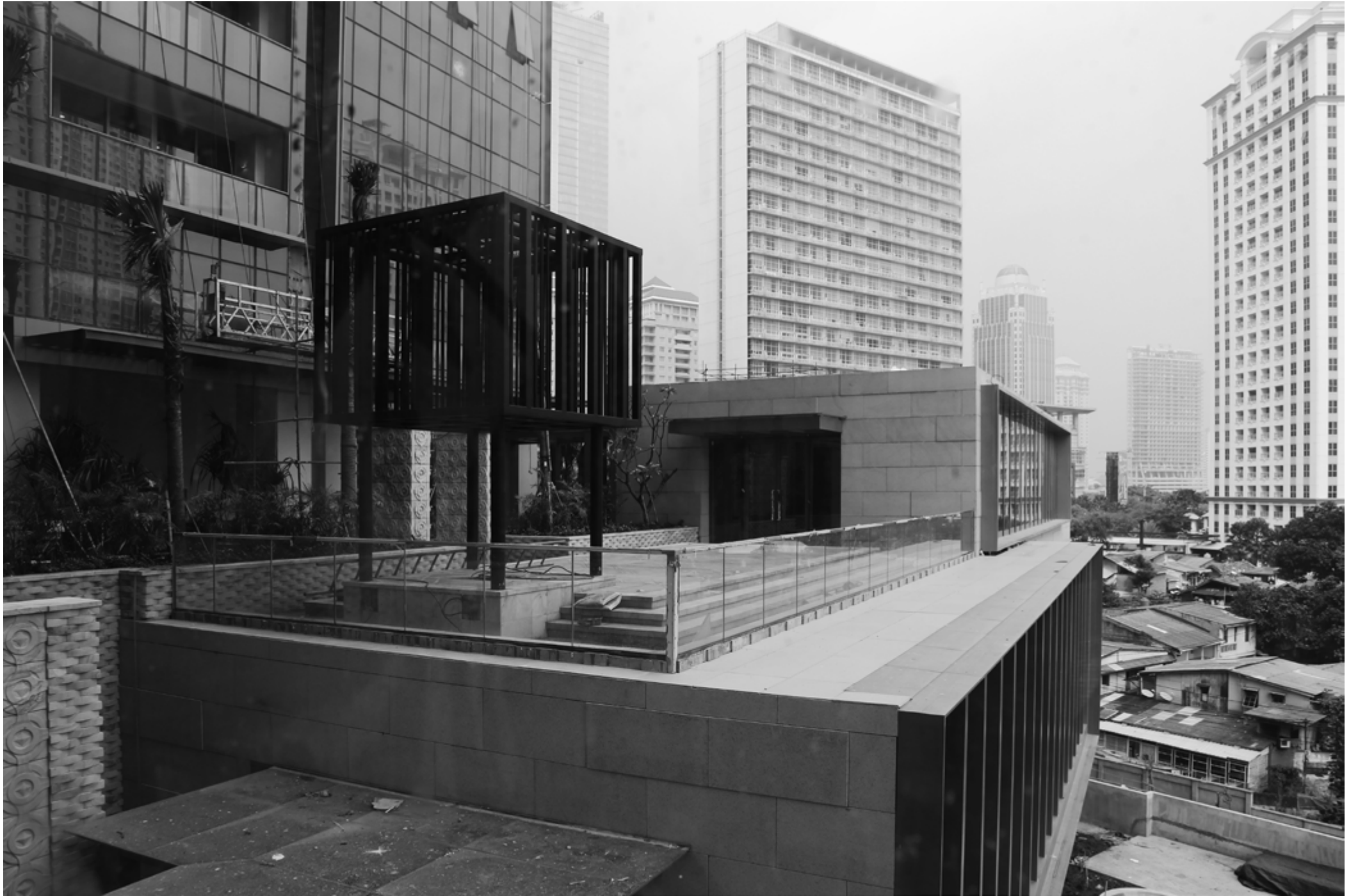
Podium at Level 3