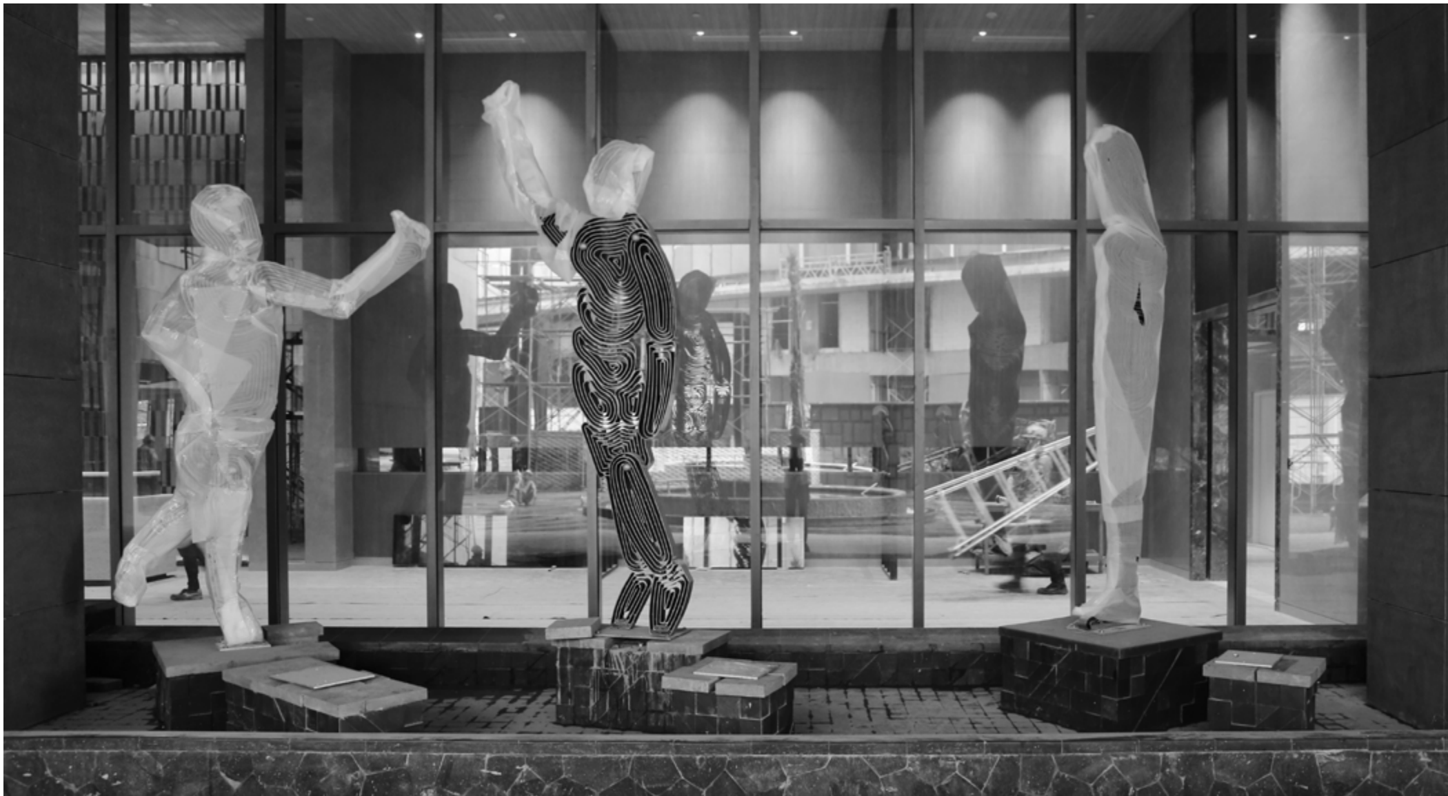
Artwork at Tower 2 & 3