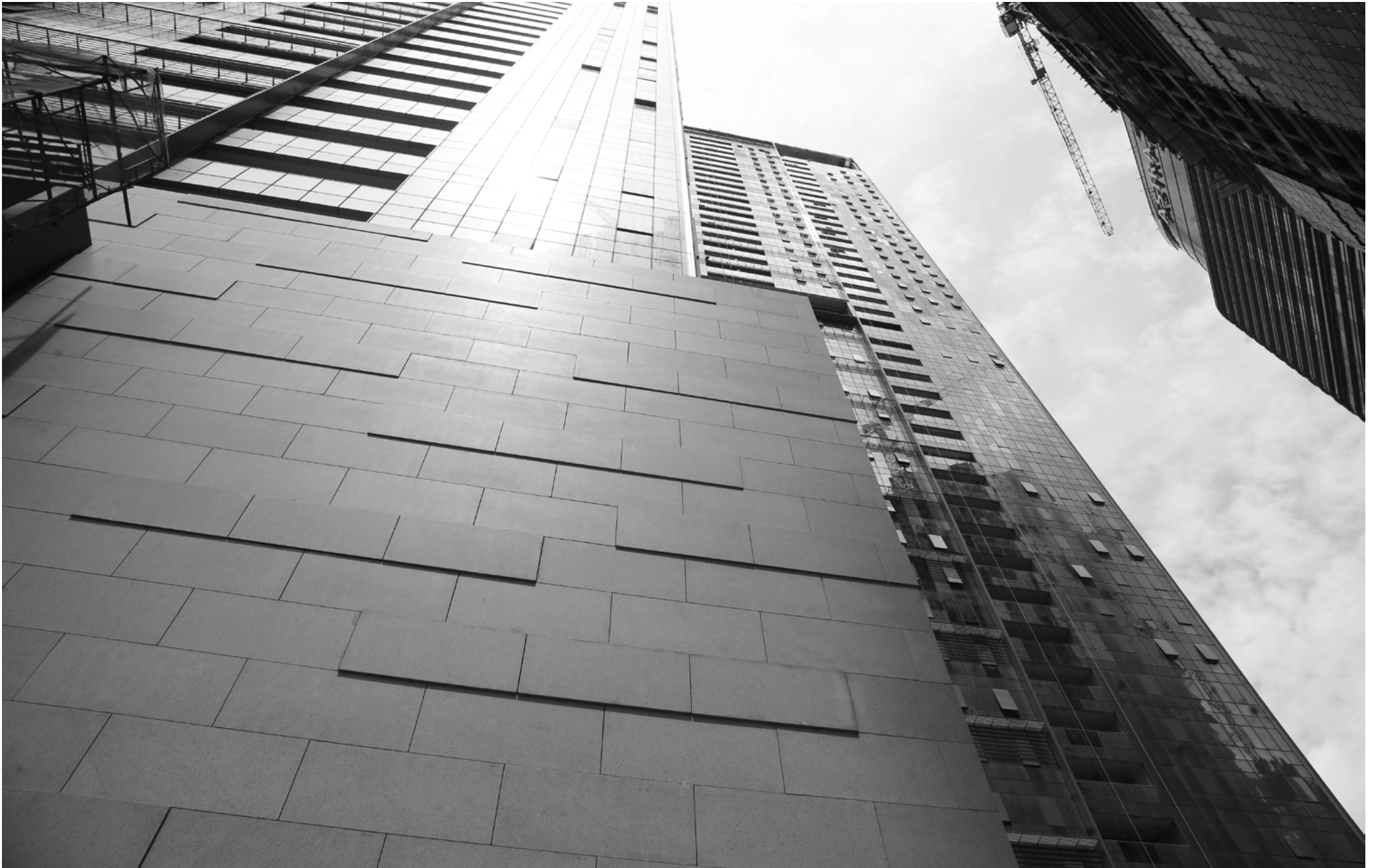
Facade of podium and tower