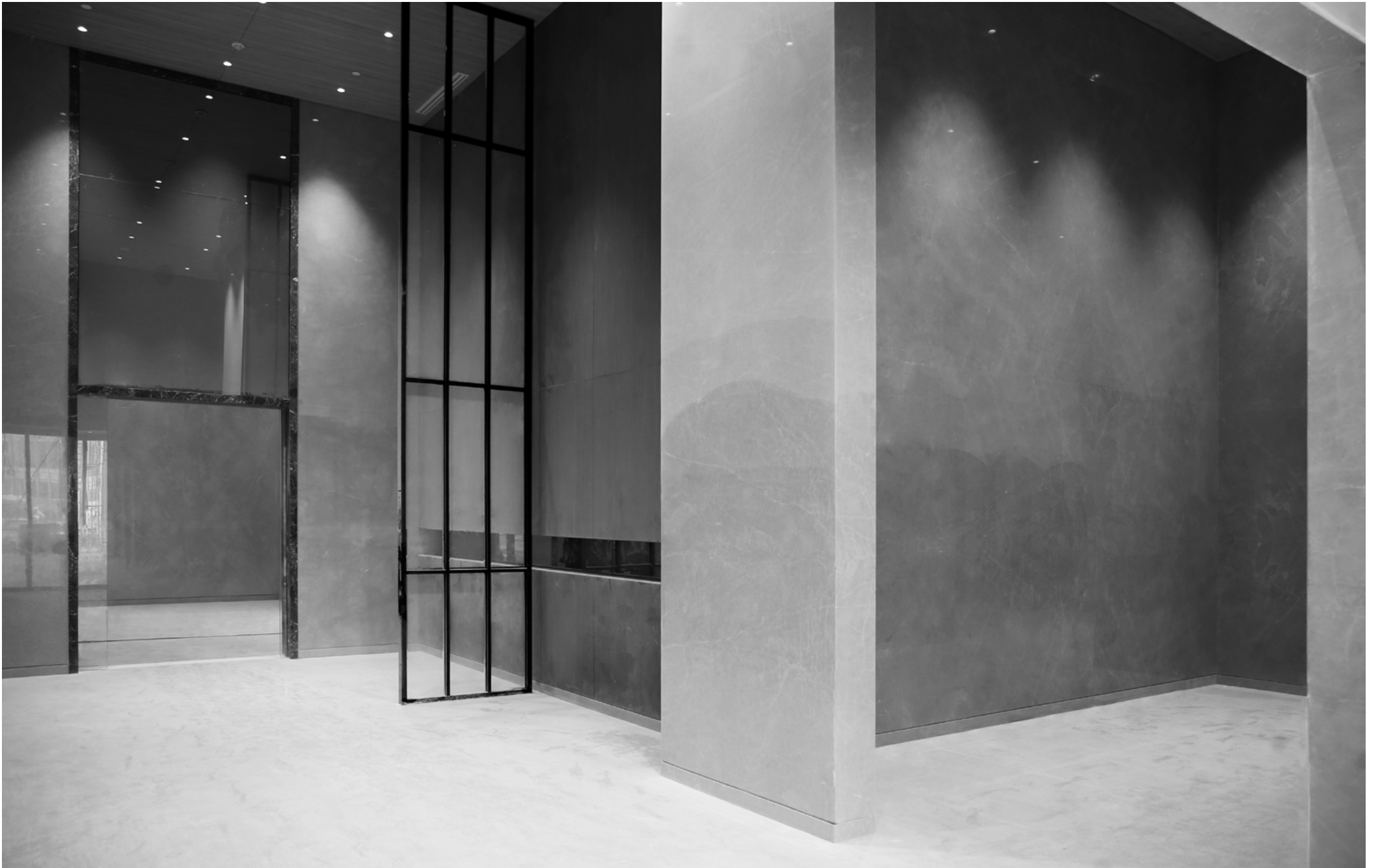
Tower 2 and 3 lounges at Ground floor