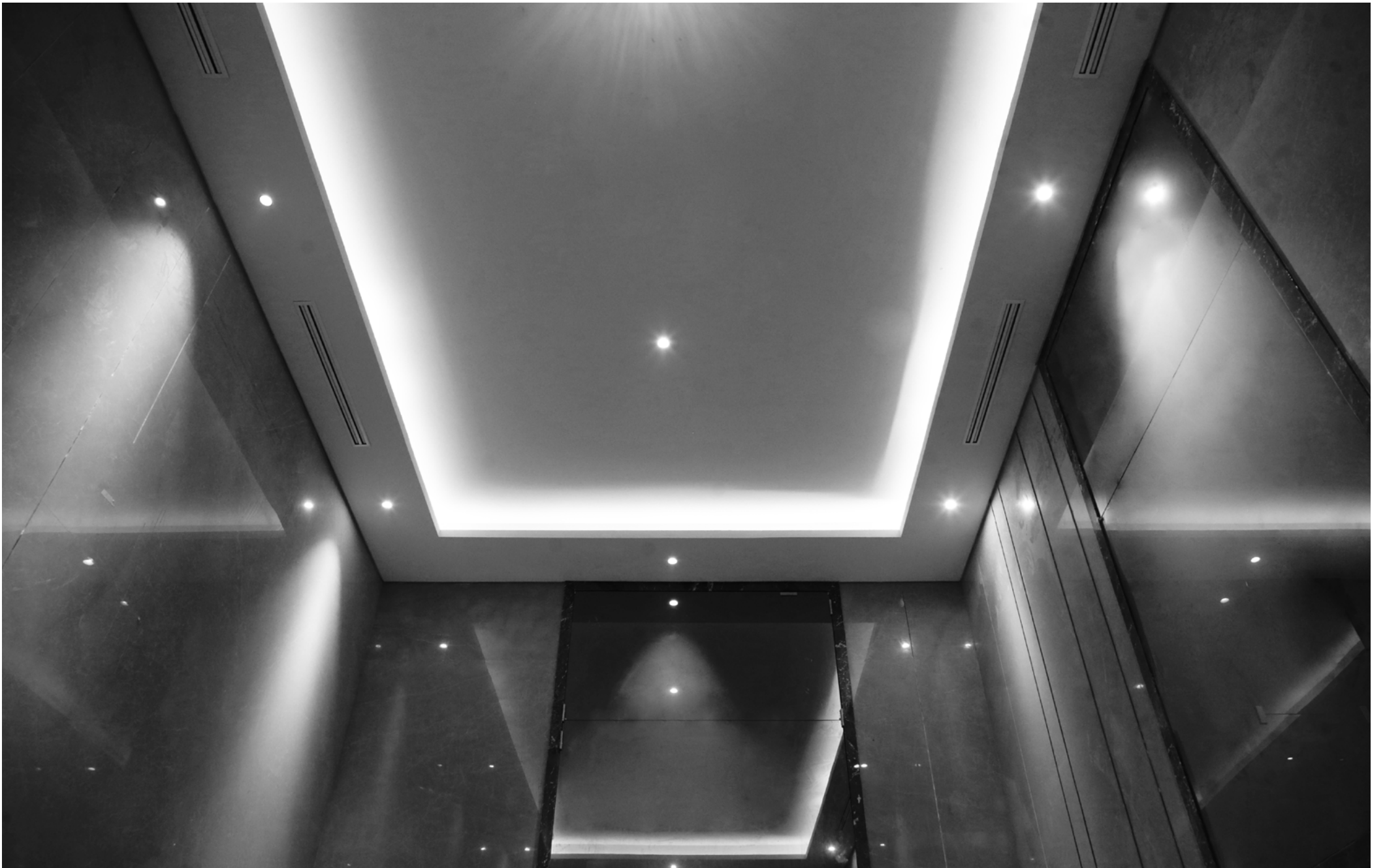
High ceiling at Ground floor lobbies