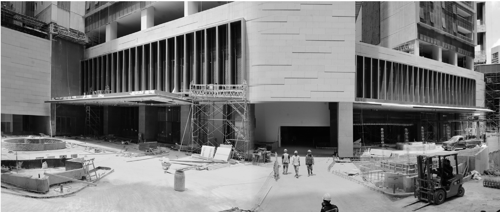
Anandamaya one and tower 2 & 3 drop offs