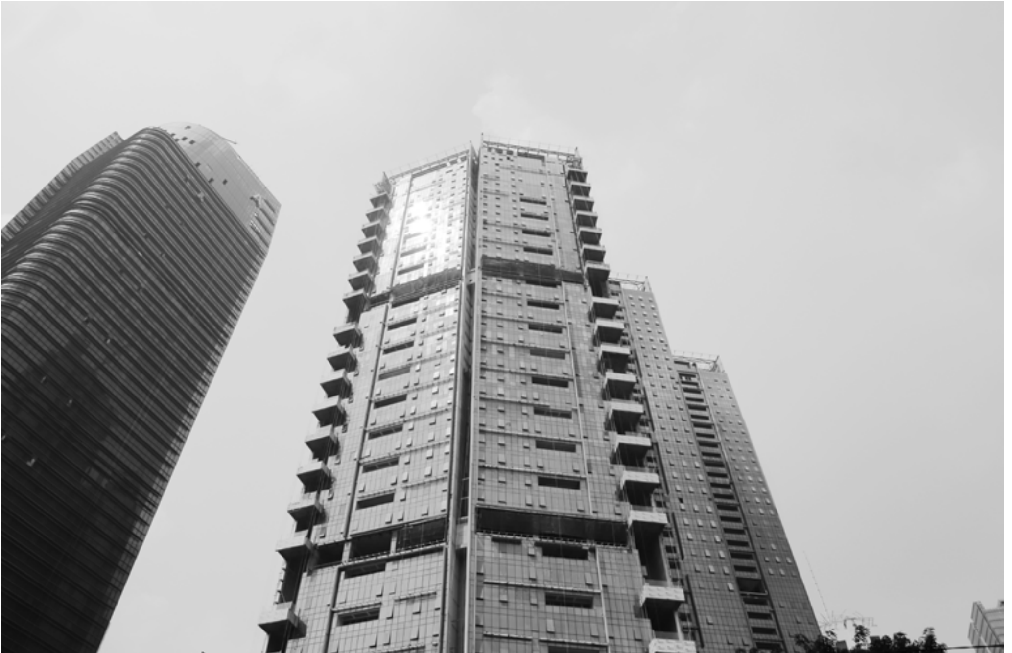
View from the north (BNI 46)