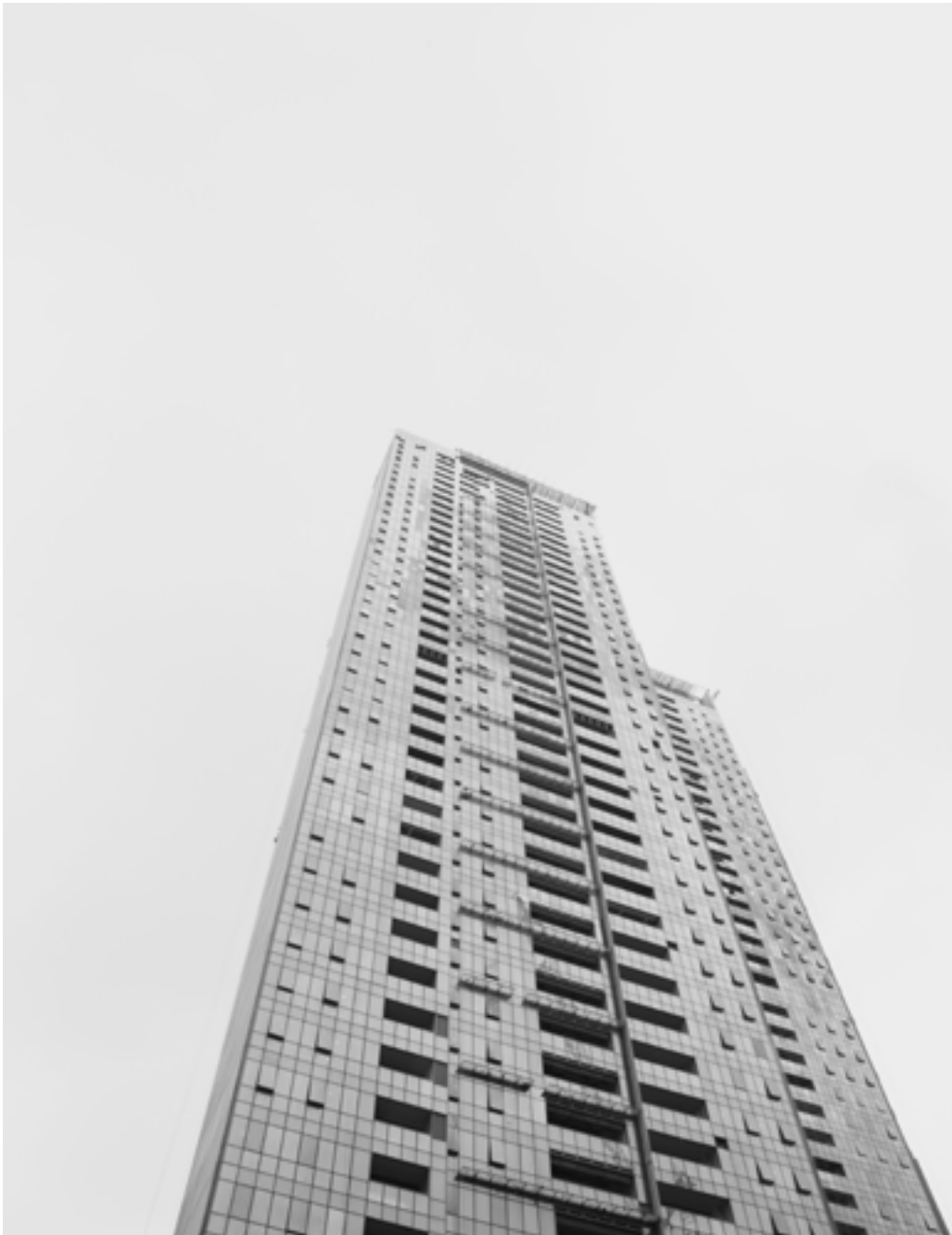
Tower 2 & 3 building facade