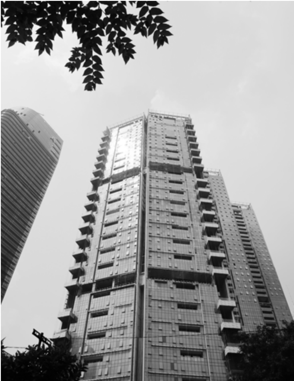
Tower 1 building facade