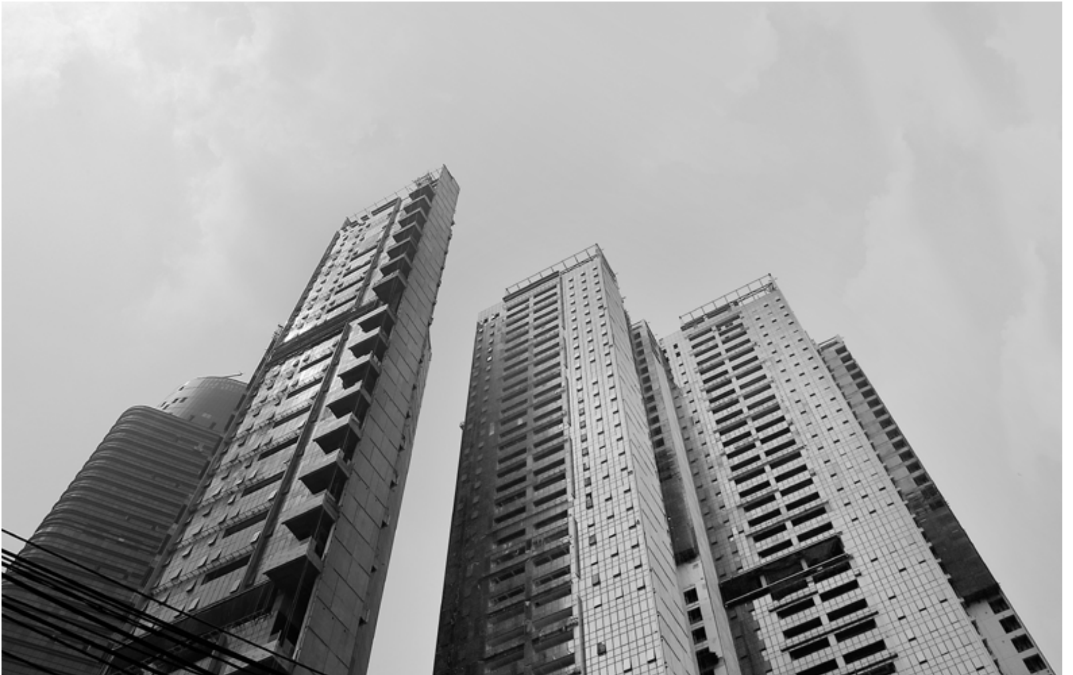
View from the west (Apartment Pavilion)