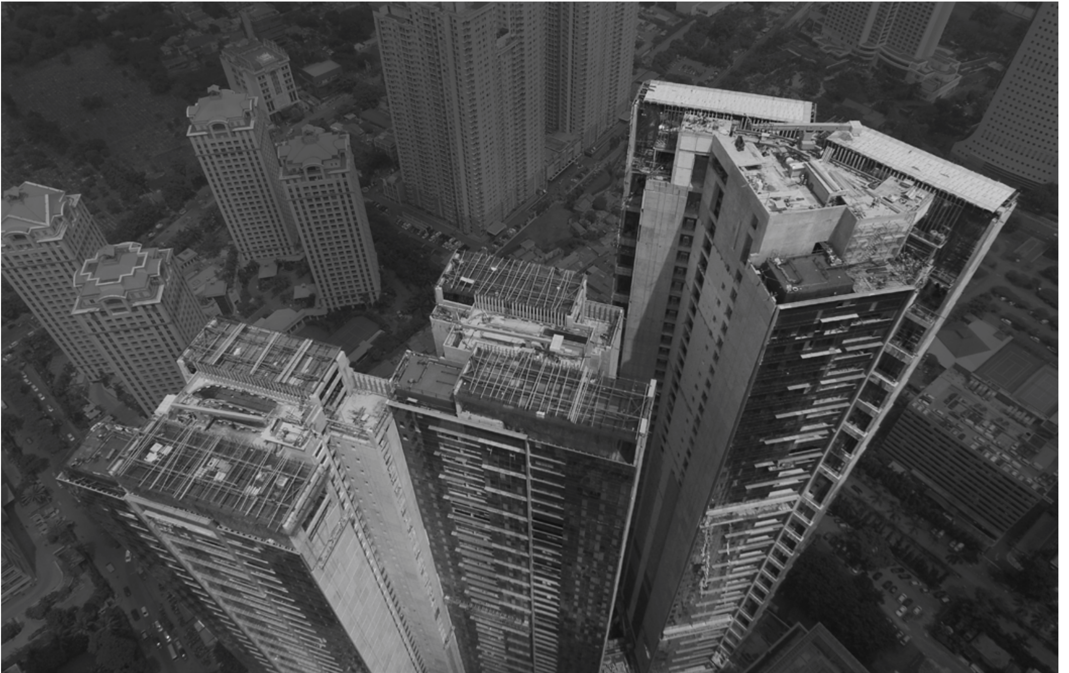
Aerial view from the top