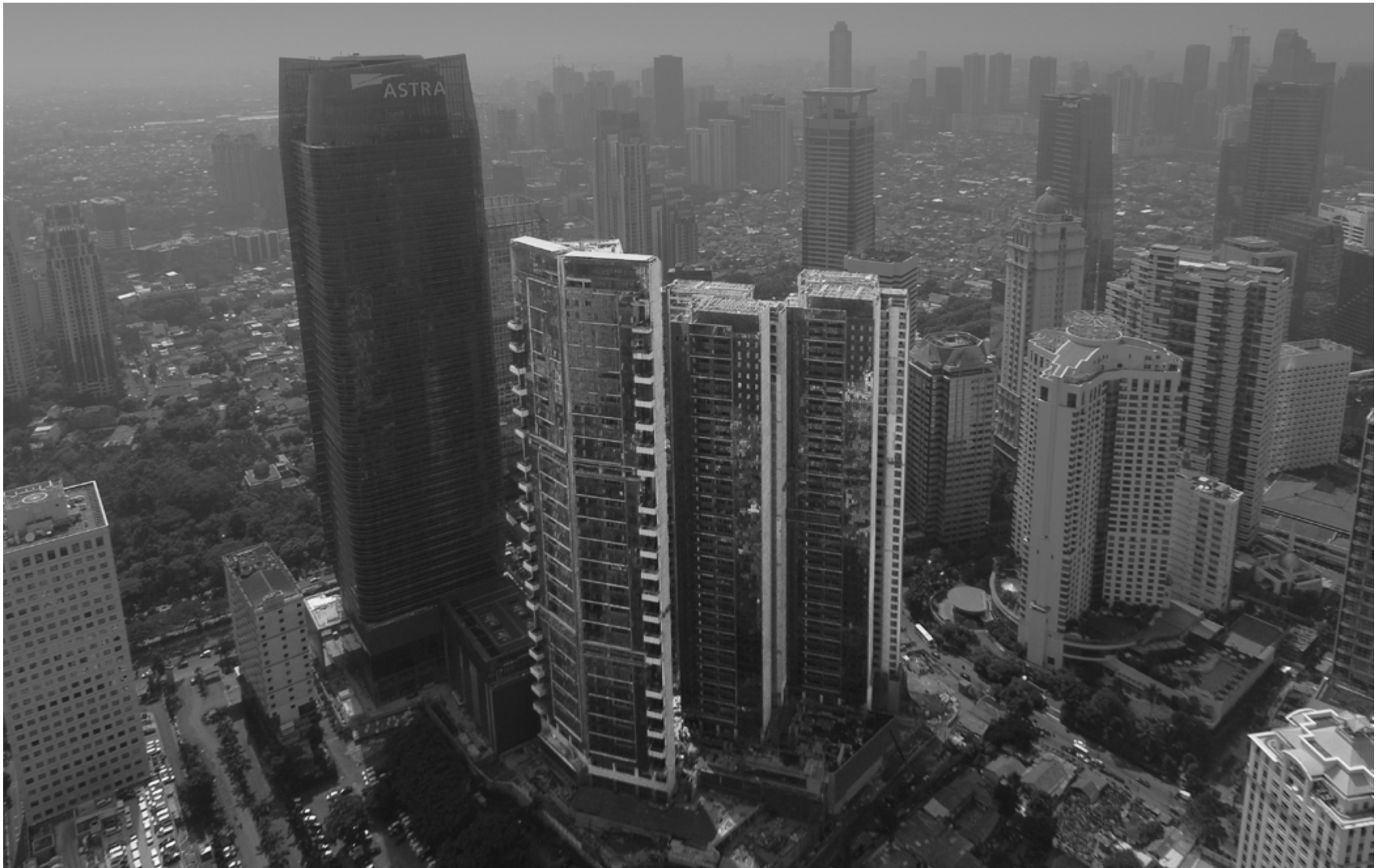
Aerial view from Shangri-La