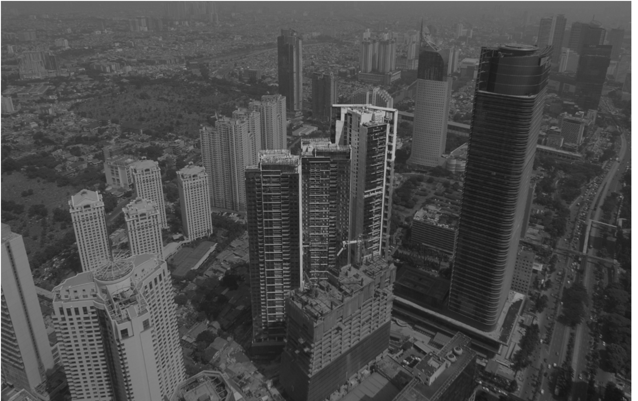
Aerial view from Sudirman