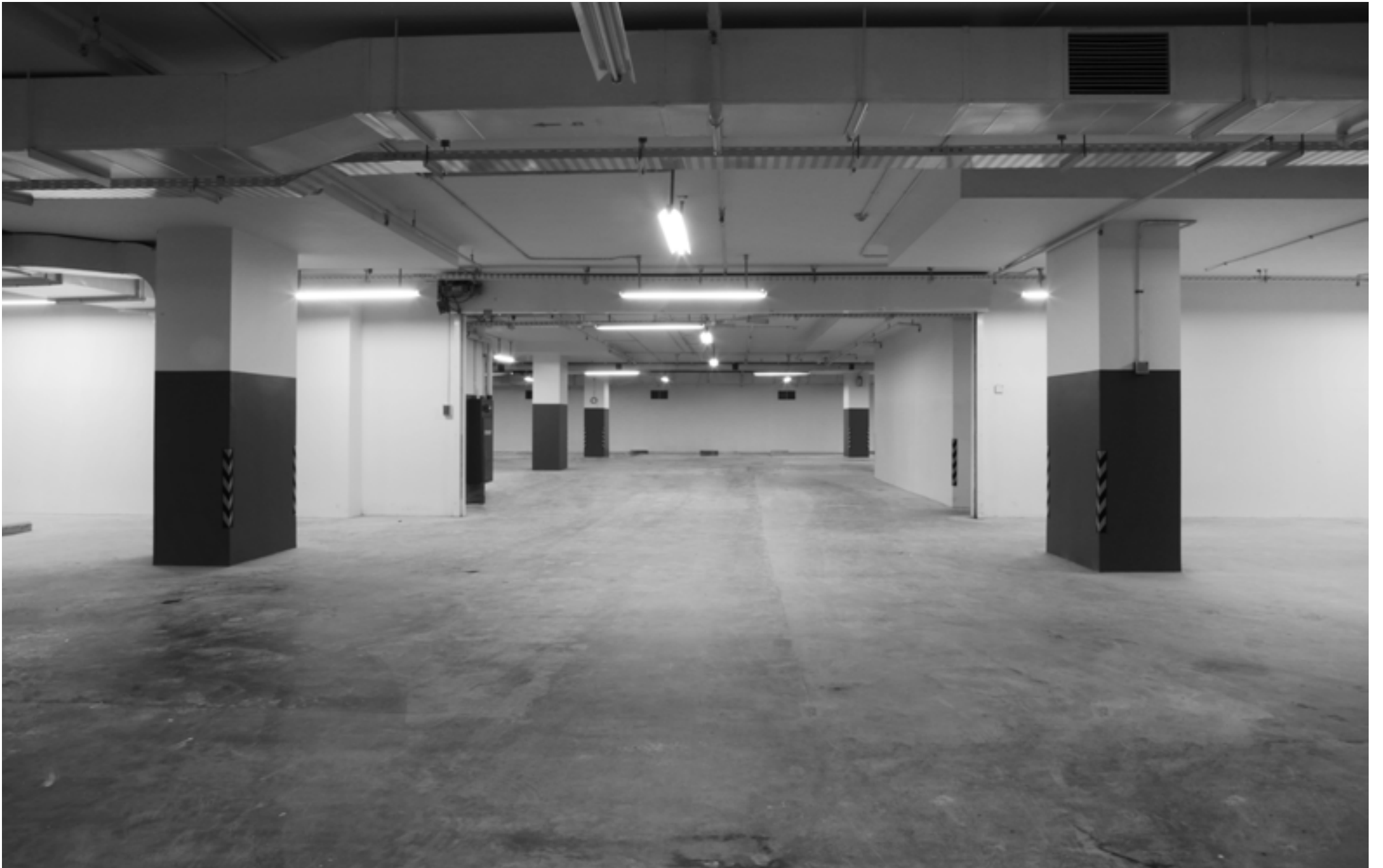
Basement car park