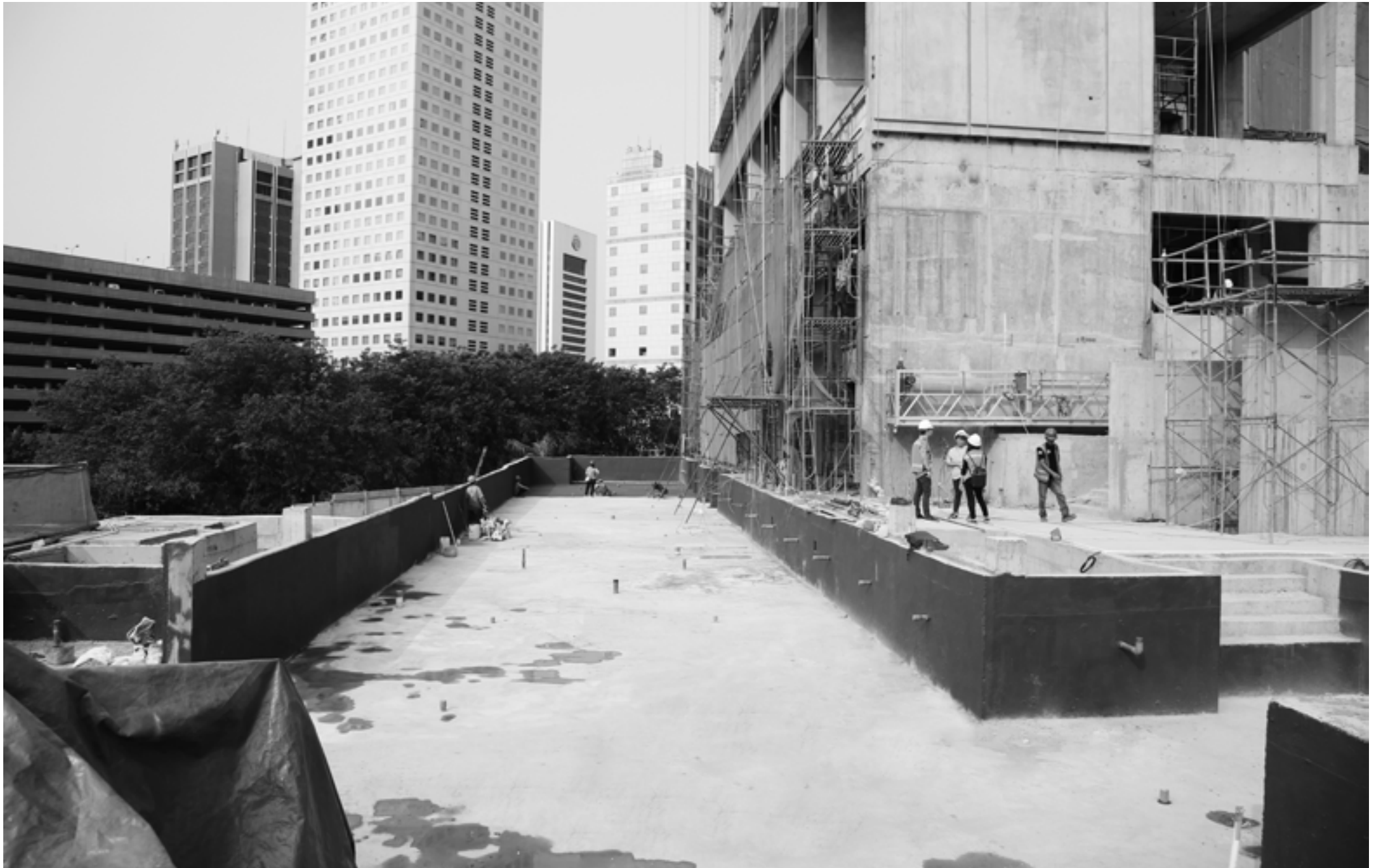
Main swimming pool